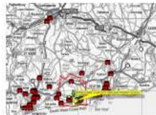
How pupils travel to school now